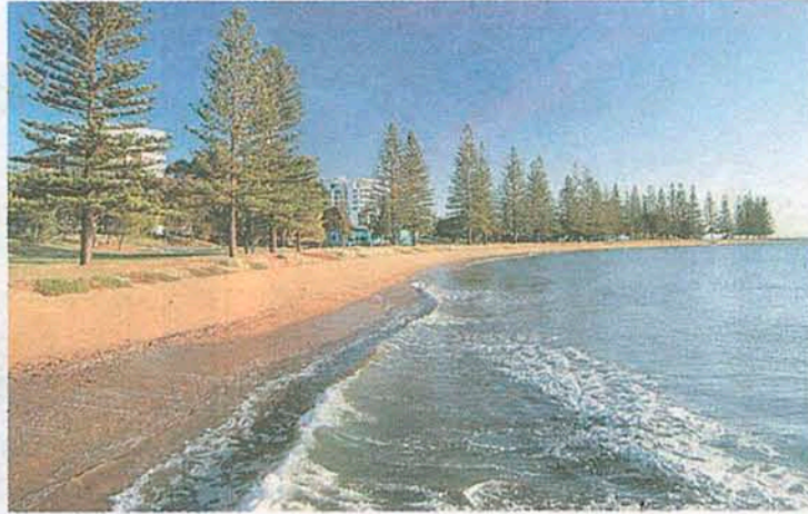
REDCLIFFE WAS OCCUPIED BY SETTLERS UNTIL THE 1880S WHEN IT BECAME A FASHIONABLE SEASIDE RESORT AND TODAY IS A BOATIES PARADISE AND SUMMER DESTINATION FOR THOUSANDS.